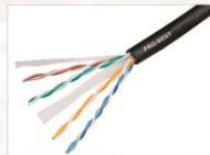
Cat6 outdoor wire. Cable