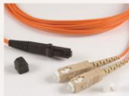
MULTI MODE SC/MTRJ