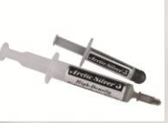
AS-5 & AS-5-12G