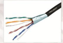
Cat5e outdoor FTP