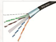
Cat6 outdoor FTP