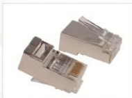
CAT.5E/6 FTP PLUG