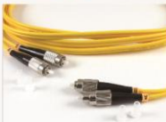
SINGLE MODE FC/PC