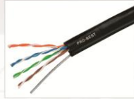
Cat5e outdoor wire. Cable