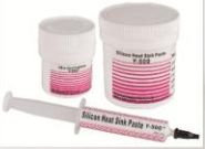
PRO-Y500 & 12 & 100